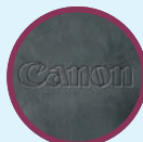
(PV) Imitation Leather