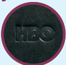
(VL) Venetian Leather